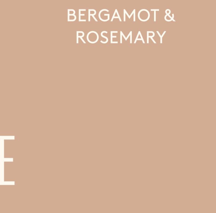
BERGAMOT & ROSEMARY