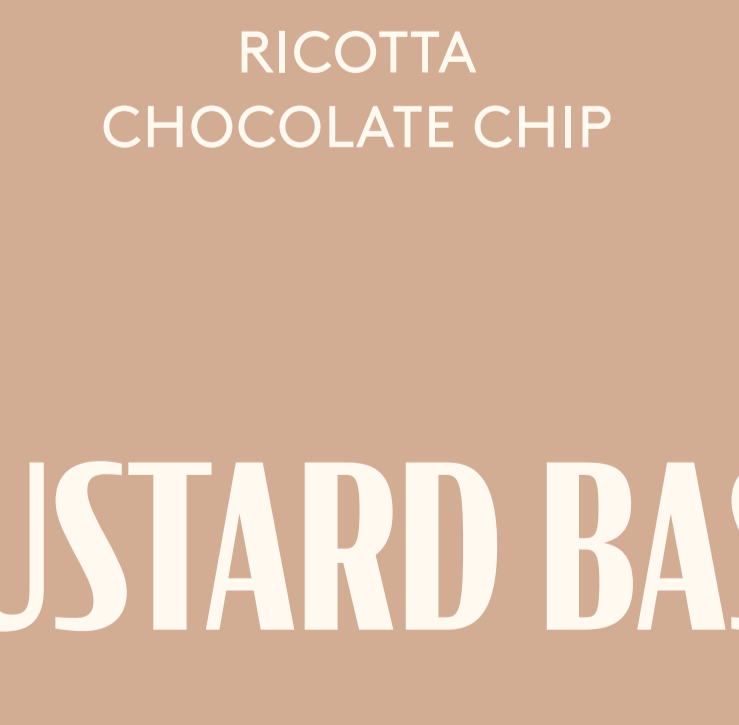
RICOTTA CHOCOLATE CHIP